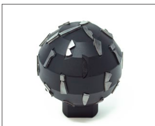
Diamond globe milling tool - asymmetrical segments - Field of application: Opening of laterals and inlet lines

Kardiam-BLACK-POWERLINE® Not for steel-reinforced concrete!