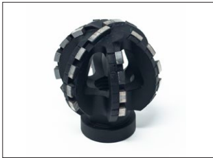
Diamond globe milling tool - transparent - Field of application: Opening of laterals and inlet lines