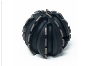
Diamond globe milling tool - with chip run-off grooves, smooth running cut - Field of application: Opening of laterals and inlet lines

Kardiam-BLACK-POWERLINE® Not for steel-reinforced concrete!