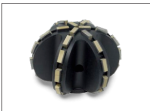
Diamond globe milling tool - transparent - Field of application: Opening of laterals and inlet lines

Kardiam-BLACK-POWERLINE® Not for steel-reinforced concrete!