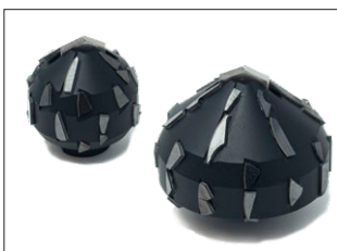
Diamond cone-cylinder milling tool - with carbide-tip, asymmetrical segments - Field of application: Opening of laterals and inlet lines

Kardiam-BLACK-POWERLINE® Not for steel-reinforced concrete!